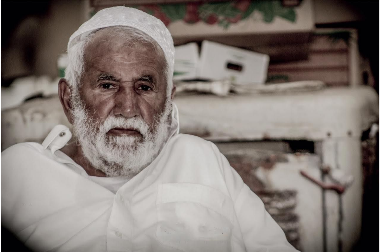
Oldery in The Dates Market, dated 5/6/2017, Unayzah Saudi Arabia via Saudi Green Building Forum 2017-2019